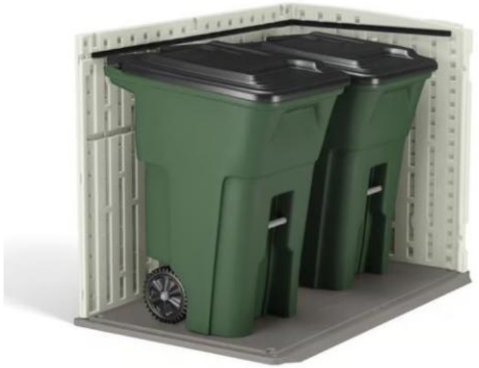
Craftsman Large Horizontal Shed CMXRSSC4750