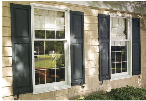
RAISED PANEL SHUTTER